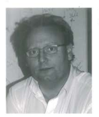
"The architectural idea is to establish an interaction between the site and the building"