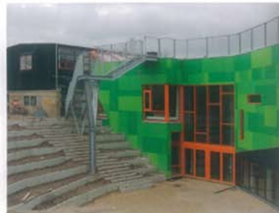
section connects the two wings of the U-shaped building and breaks up the old one through the use of a richly contrasting scheme of colours.

adjoining flat, concrete buildings with their dark wood and square corners. In 2002, Lund turned a U-boat factory into an office building. Two extensions made of glass and steel extend the industrial building and introduce light into the large rooms. The three buildings of the Villa L. in Hørsholm, Denmark (2002) are fanned out on top of the highest point of this extensive site. The perspective on the side facing the street is determined by the brick elevation. The buildings open out onto a lake through generous, glass façades. Several school buildings were realized in 2005. Along with architects from CEBRA, these included the Bakkegård and Ordrup schools. The primary school in Ordrup, a brick building from the year 1919, had an extension added to it. The new